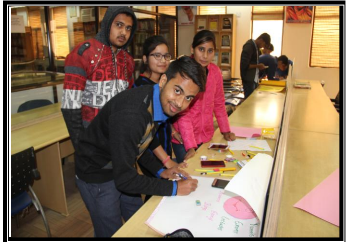
Art n Craft Session during Induction Program @LLOYD