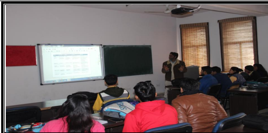
Lectures on Competition, Co-operation, Ragging & Discipline in students life by faculty members during Induction Program @ LLOYD