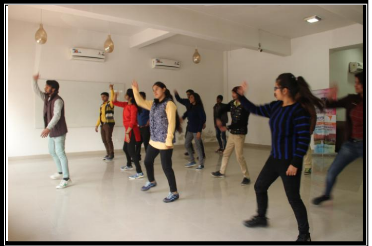
Morning Zumba session on 4 th day of induction program